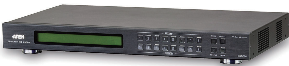
VM5808H Front view