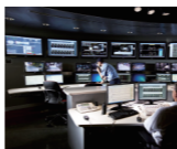
Command and control