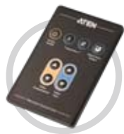
IR Remote Control Included